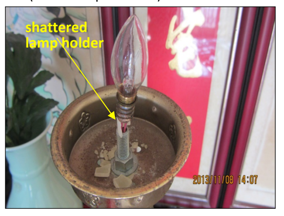
(c) danger of a shattered lamp holder