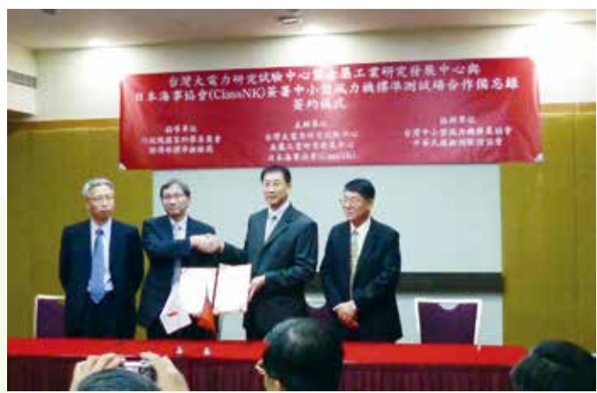
▲The Signing Ceremony for the MOU of Small and Medium Sized Wind Turbine Standards Test Site

◆ BSMI held the "The Signing Ceremony for the MOU of Small and Medium Sized Wind Turbine Standards Test Site signed by Taiwan Electric Research & Testing Center (TERTEC), Metal Industries Research and Development Center (MIRDC) and Nippon Kaiji Kyokai (ClassNK)" The MOU was beneficial to the standard test site of our country to acquire international cooperation test results, and BSMI also was listed as a cooperative unit recommended by ClassNK.