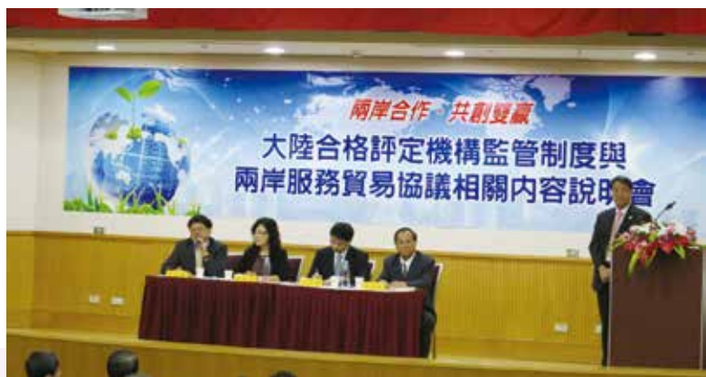
▲Q&A session of the "Information Meeting on Requirements for Establishing Conformity Assessment Bodies in Mainland China and the Cross-Strait Agreement on Trade in Services."

"Cross-Strait Seminar on Metrology Management System" in Guilin City, Guangxi Province, Mainland China on August 26-29.