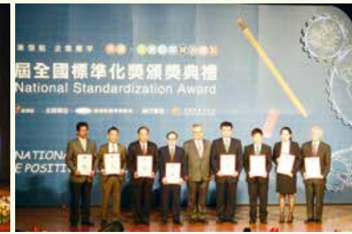
▲2013 National Standardization Award