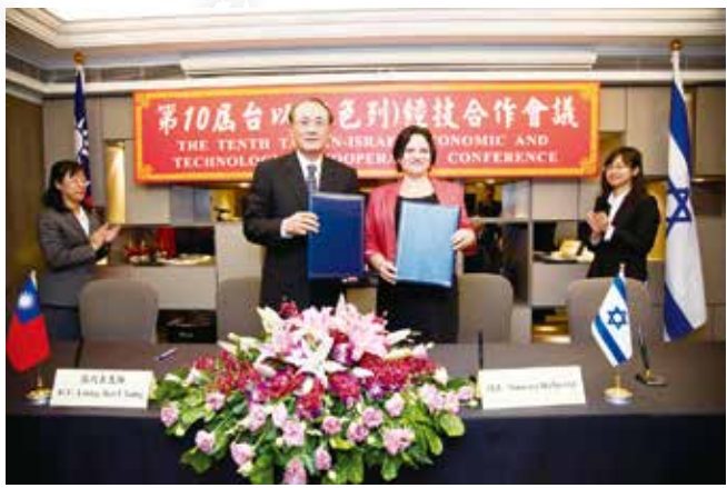
▲ Group photo of Taiwan and Israel representatives after signing the "Agreement on Standardization, Conformity Assessment & Metrology" at the 10<sup>th</sup> Taiwan-Israel Economic and Technological Cooperation Conference.